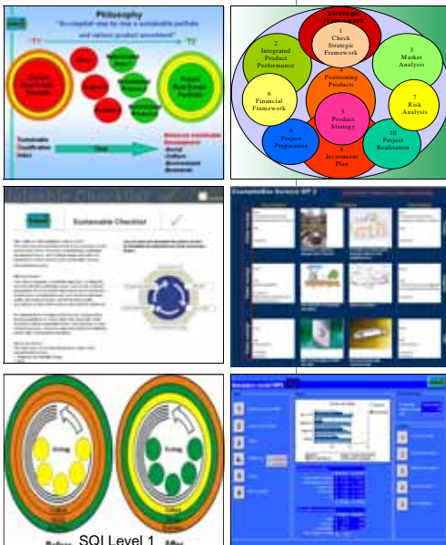
Examples of SUREURO systems