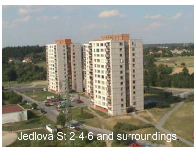
Jedlova St 2-4-6 and surroundings