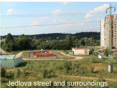
Jedlova street and surroundings