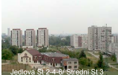
Jedlova St 2-4-6/ Stredni St 3