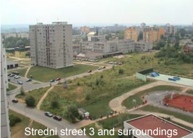
Stredni street 3 and surroundings